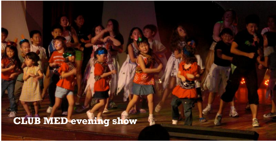
CLUB MED evening show

We organized the program at the Kids Club in Club Med during the September school holidays. 22 parents and kids joined us in the 5 day retreat that featured our children and others for three nights of showcases in the evenings of Club Med Bintan. Items presented were from Popstars, UrbanKids™, JazzKids™ and BroadwayKids™ program held during thematic days: Singing Day, Dance Day and Theater day. Do look out for our next “Kids Performing™ goes .....” school holiday program this year that will make your holiday a memorable one.