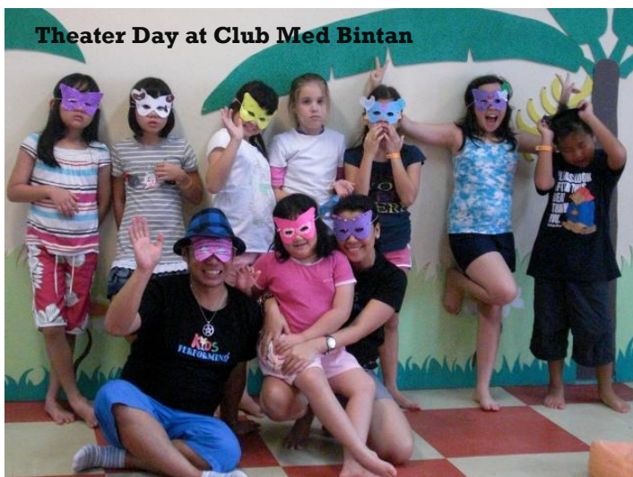
Theater Day at Club Med Bintan

We organized the program at the Kids Club in Club Med during the September school holidays. 22 parents and kids joined us in the 5 day retreat that featured our children and others for three nights of showcases in the evenings of Club Med Bintan. Items presented were from Popstars, UrbanKids™, JazzKids™ and BroadwayKids™ program held during thematic days: Singing Day, Dance Day and Theater day. Do look out for our next “Kids Performing™ goes .....” school holiday program this year that will make your holiday a memorable one.